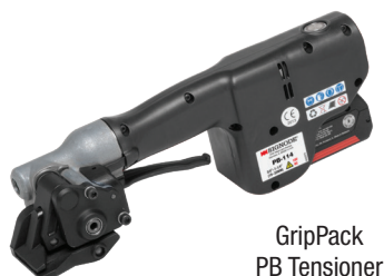
GripPack PB Tensioner

Signode's line of GripPack battery-operated tools enhance productivity and operator safety for applications that utilize steel strapping.