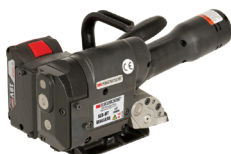
GripPack SLB Combination Tool