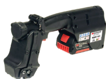
GripPack RCBS/RCBD Sealer