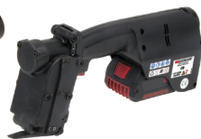
GripPack CB Cutter